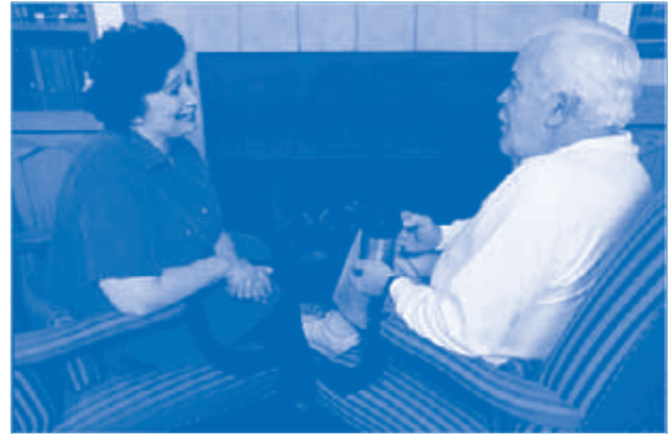
The inaugural Member Information Session is your chance to hear the latest end-of-life news and to ask questions

Bookings: Essential, call the office on 9877 7677 or email dwdv@dwdv.org.au to reserve your place.