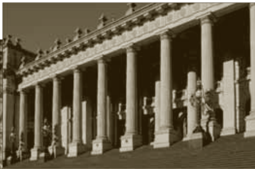
The Parliament of Victoria, Spring Street