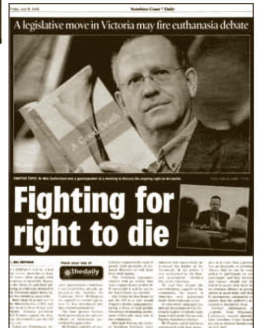
A big splash in the Sunshine Coast Daily organised by VESQ Sunshine branch