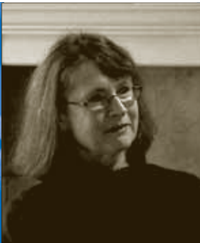
Senator Ginny Burdick